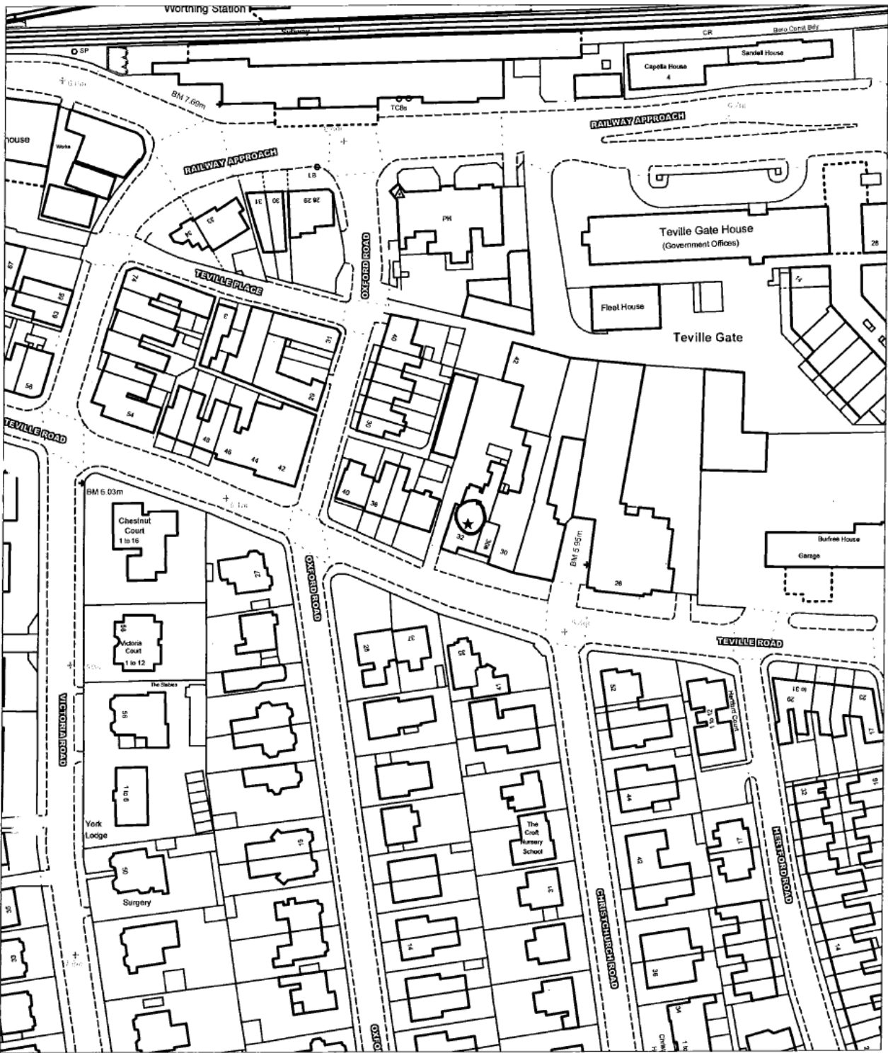
Title: Worthing Kebab House Scale 1:1250 Date Plotted 14/11/2005

REPRODUCED FROM ORDNANCE SURVEY MAPPING WITH THE PERMISSION OF THE CONTROLLER OF HER MAJESTY'S STATIONERY OFFICE (C) CROWN COPYRIGHT. UNAUTHORISED REPRODUCTION INFRINGES CROWN COPYRIGHT AND MAY LEAD TO PROSECUTION OR CIVIL PROCEEDINGS. THIS COPY HAS BEEN PRODUCED SPECIFICALLY FOR THE MAP RETURN SCHEME. NO FURTHER COPIES MAY BE MADE. LICENCE NO: 100024321